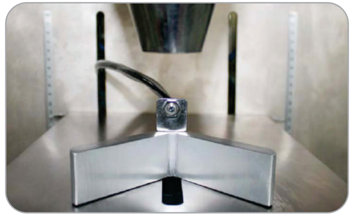
PMC 40 - Bottle Censor