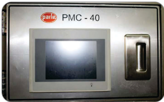
PMC 40 - Soft Touch HMI