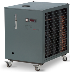
ProfiCool Genius (with option castors)